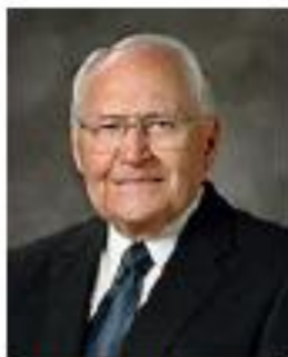
Elder L. Tom Perry