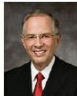
Elder Neil L. Andersen