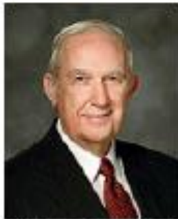
Elder Richard G. Scott