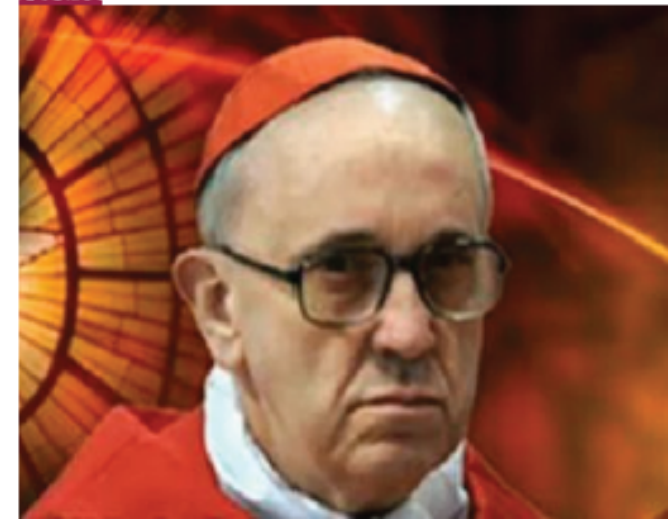
Pope Francis Bergoglio