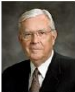
Elder M. Russell Ballard