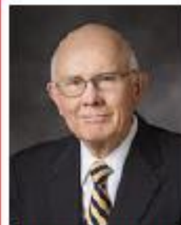
Elder Dallin H. Oaks