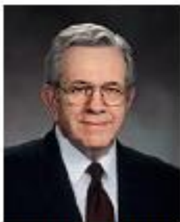
President Boyd K. Packer