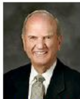
Elder Russell M. Nelson