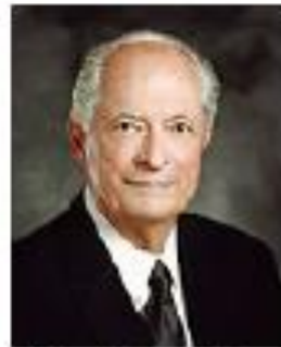
Elder Robert D. Hales