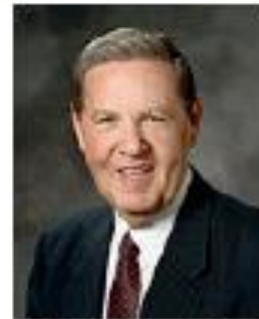
Elder Jeffrey R. Holland