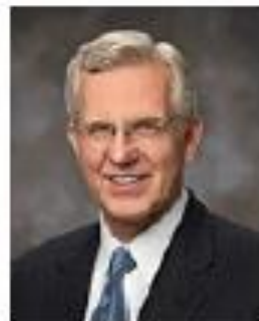
Elder D. Todd Christofferson